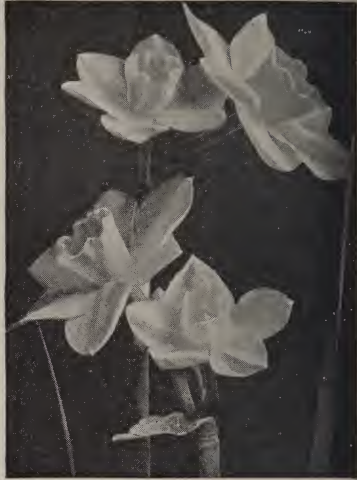
Jonquilla, Giant Campernelle Rugulosus